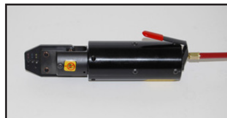
PMT232 Pneumatic Tool