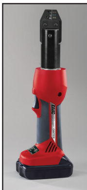
GMTE232B Battery Tool

Battery and Pneumatic Powered Versions are Available!